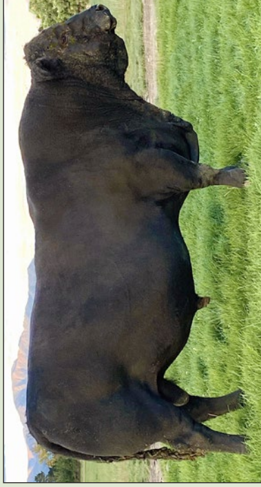
TURIHAUA CRUMP E5