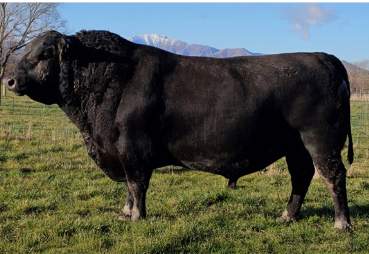
SEPTEMBER 2025 BREEDPLAN

NZ Record price 10yr old Cow - Meadowslea G1000 - is the paternal Grandam of Quartz