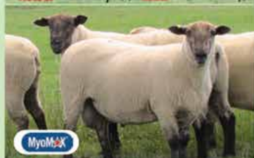
kelso Romney (1/2 kelso X 1/2 Romney)