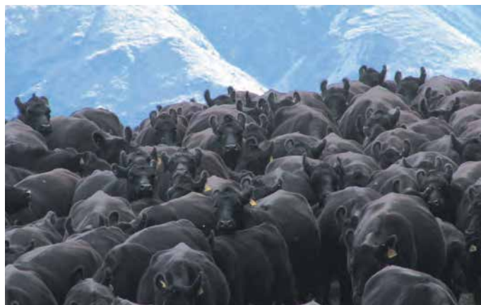
Meadowslea cows and calves come down off the hill for weaning.

A cow's condition and her ability to lay down fat in times of surplus, and to draw on that fat as an energy source in times of feed deficit is vitally important. This rib and rump fat is the cheapest and most efficient energy store on the farm, and will determine the ability of the herd to get back in-calf and rebreed early after a hard winter or difficult spring.