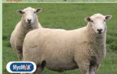
kelso. Terminal Tough Hill-bred Sire