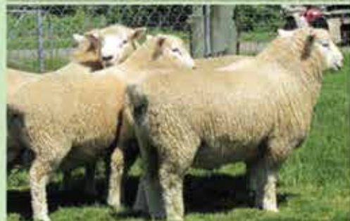
1/2 Romney x 1/2 Perendale (Romdale) 1/2 Romney x 1/4 Perendale x 1/4 Texel