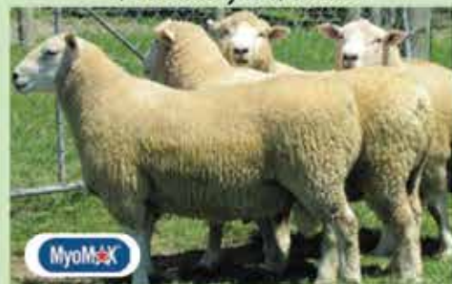
1/2 Romney X 1/2 Texel 3/4 Romney X 1/4 Texel