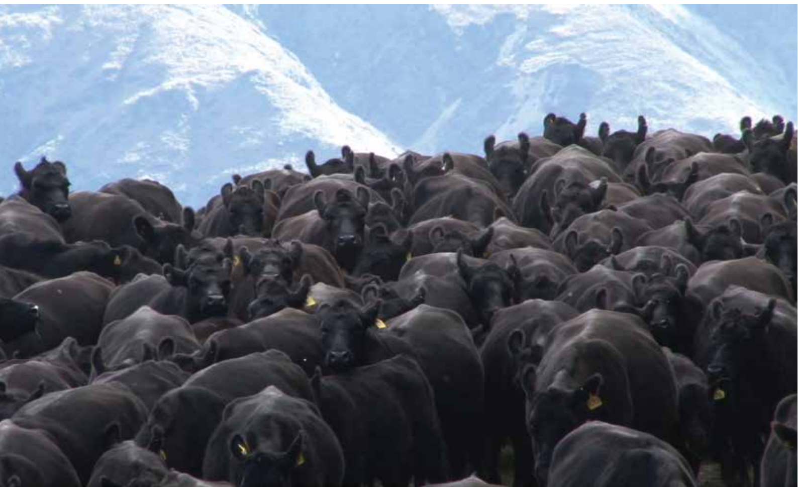
Meadowslea Stud cows and calves come off the hill for weaning