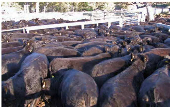
Meadowslea stud 18mth in-calf heifers showing good fat coverings and ready to winter on the hill.

A cow's condition and her ability to lay down fat in times of surplus, and to draw on that fat as an energy source in times of feed deficit is vitally important. This rib and rump fat is the cheapest and most efficient energy store on the farm, and will determine the ability of the herd to get back in-calf and rebreed early after a hard winter or difficult spring.