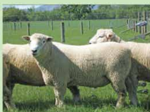
High Survival, High Performance Romneys