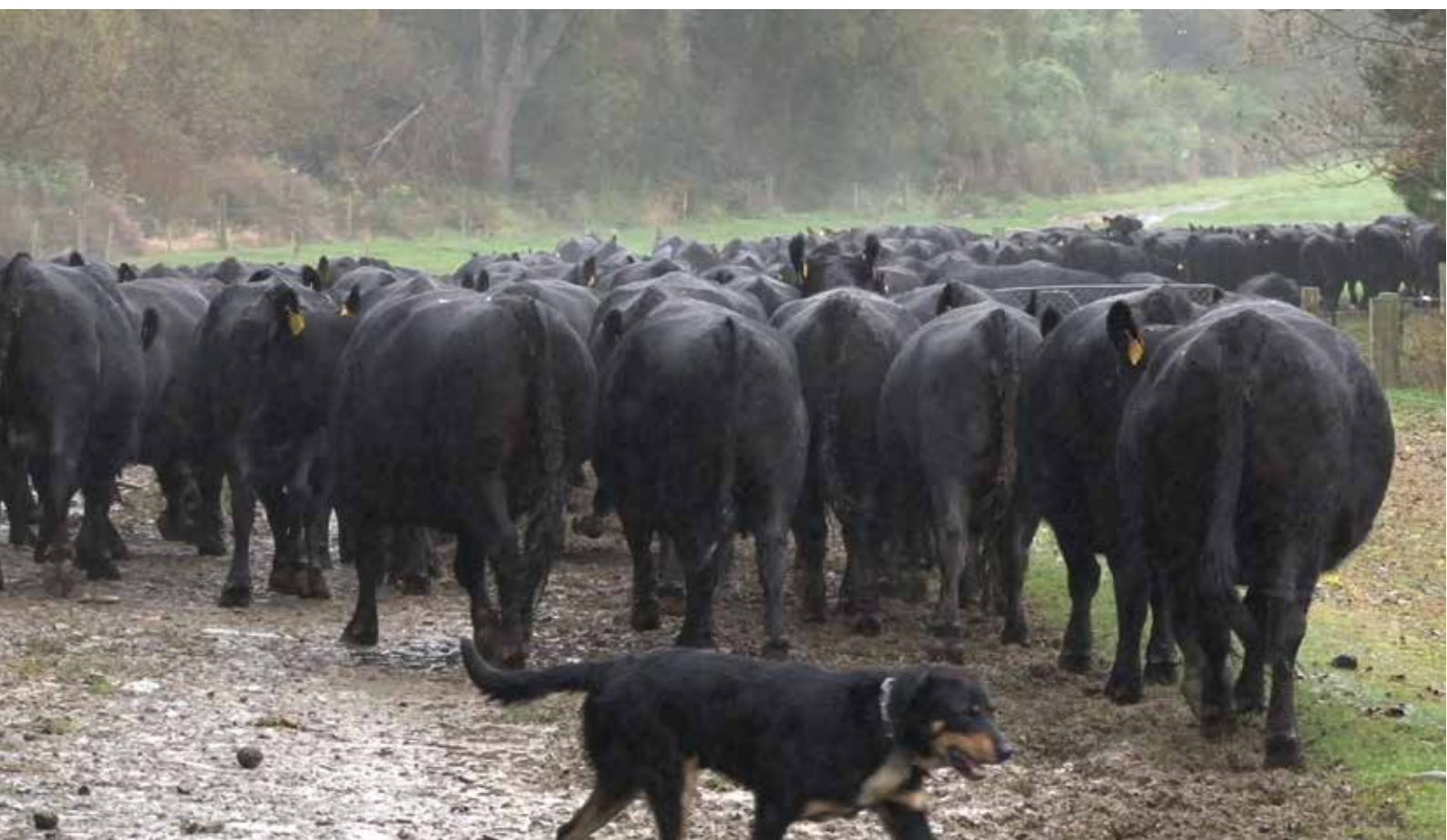
Meadowslea Stud cows after weaning - job done for another year!