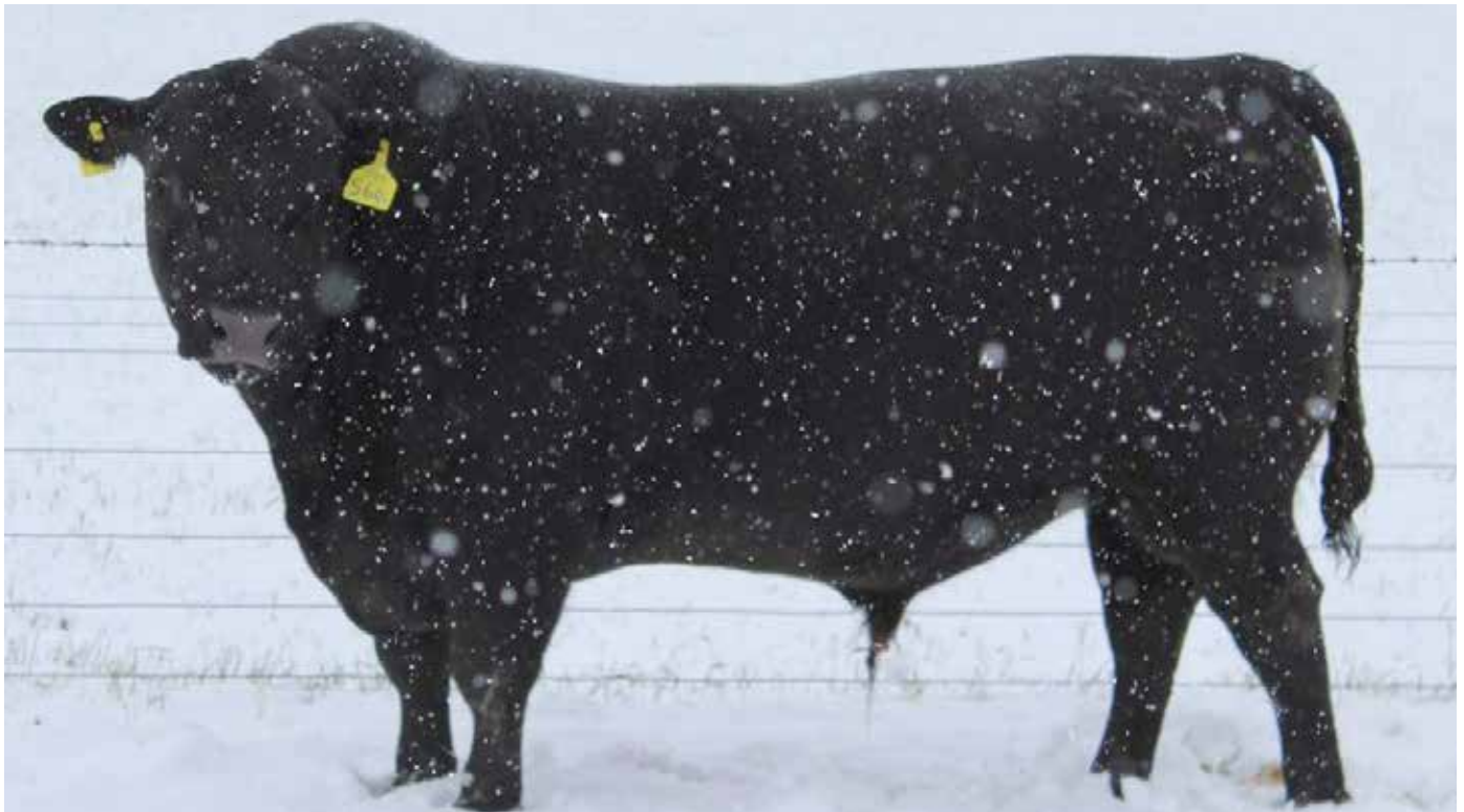
2021 TRANSTASMAN ANGUS CATTLE EVALUATION EBVS

MEADOWSLEA G1000: 10-year-old cow sold for a NZ record price of $16,000 at the Meadowslea female sale in May 2021. She was sold to Ballanee Angus in Victoria, Australia, and will be flushed for embryos to export with a limited number also to be available in NZ. G1000 scanned as a 2-year-old heifer with the biggest EMA of her year group, and has a rib fat EBV in the top 2% of the breed. She has 11 grandsons in the catalogue as well as a direct son at lot 13.